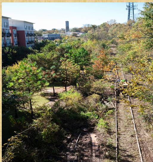
Atlanta Beltline Before and After