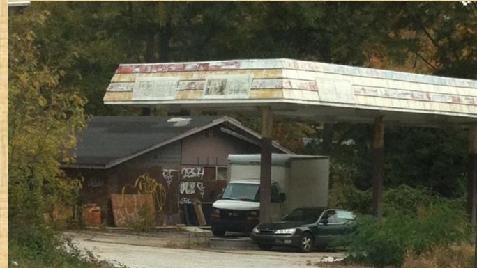
East Decatur Greenway (before and after)

OMB setting aggressive annual targets: 684 for FY18