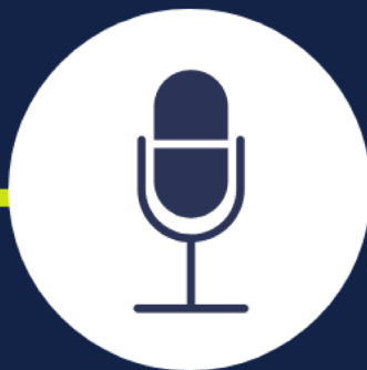
Paid News & Social Media