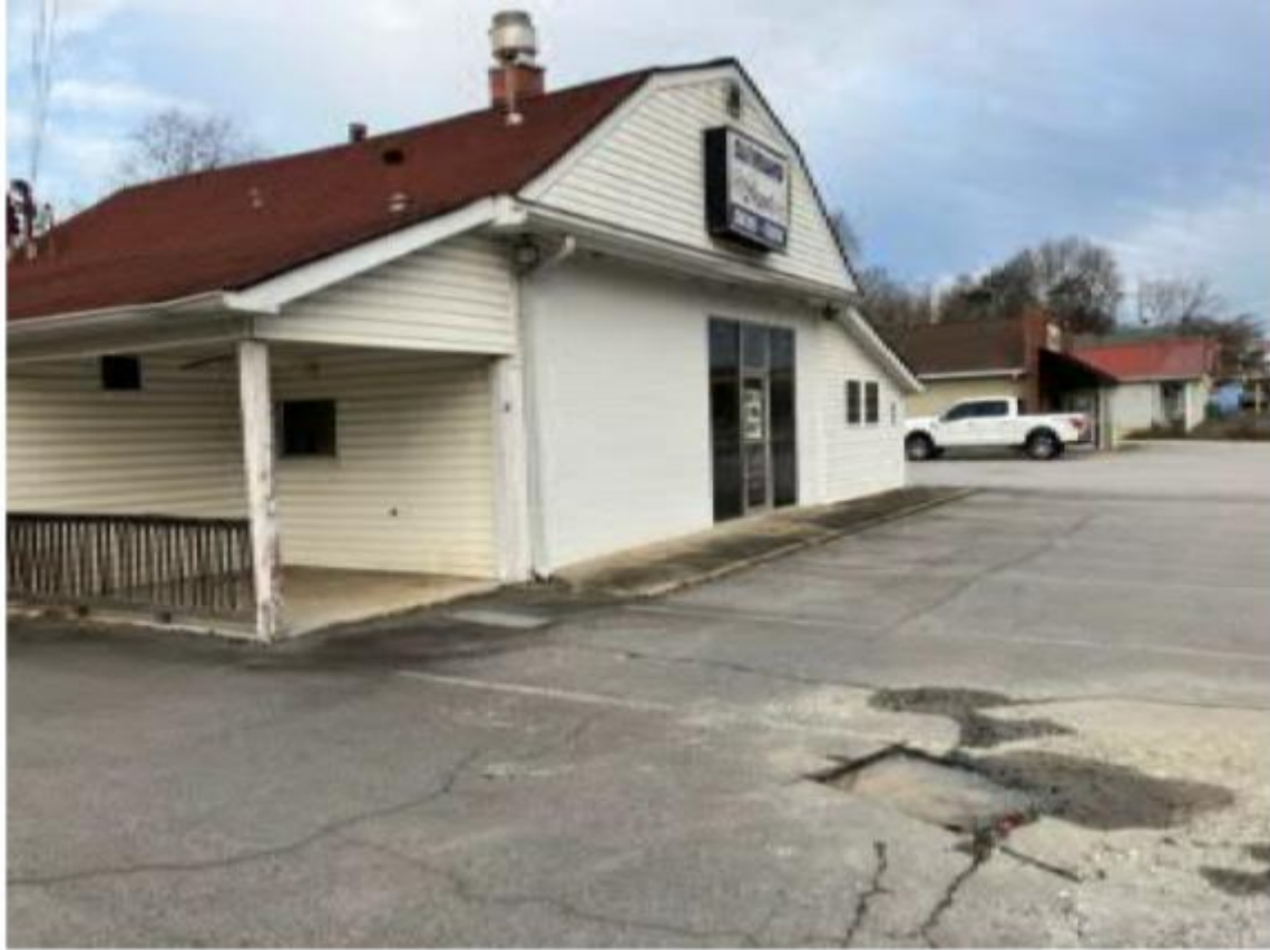
Photo #1 View of the exterior Cleveland Doughnuts. View is to the north.